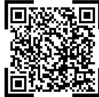
Venous IVUS app